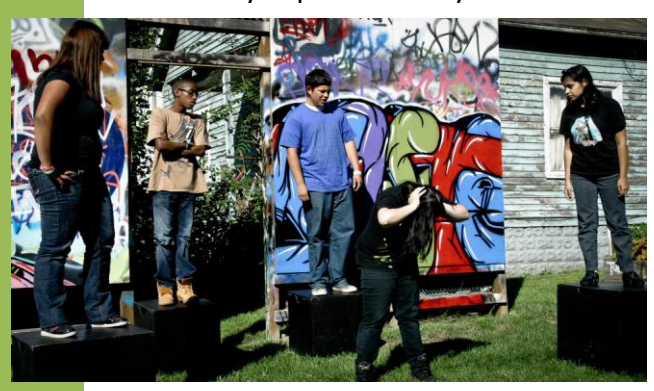
Matrix Theatre Company performs Detroit Dreaming in The Alley Project

Matrix's Detroit Dreaming is a collaboratively devised performance piece that takes on, as though trying to exorcise by confrontation, demoralizing negative perceptions of Detroit that its young creators are navigating. The stereotypes and misrepresentation they have to deal with are revealed through a series of pointed scenes. The situations that provide the conflict are inspired by actual experience or constructed in response to negative or misleading stories found on YouTube and other digital platforms that have become our modern, open-source encyclopedia society.