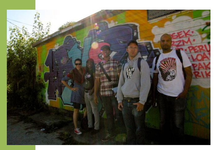
MicroFest participants visiting The Alley Project (TAP)

Many of us were magnetized by colorful mural walls, planted perpendicular to the street, reminding me of a double stack of oversized blackboards from my public elementary school. Rising from the bottom edge of the murals were graffiti style name "pieces" ringing bright in blue, green, purple, and shades of red and pink. Each piece was framed by competing layers of tags that made the pieces stand out, to look like what graffiti writers call "burners." Above and below the walls, in the wooden frames used to erect the murals, were spray paint cans stacked together on their sides, leaving only the tops visible, forming a kind of three-dimensional mosaic tiling.