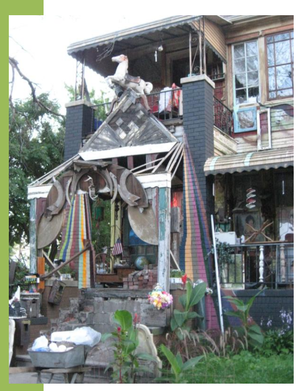
House transformed by Power House Productions, Banglatown neighborhood of Detroit

In an article for HowlRound, the digital theater journal, NET Executive Director Mark Valdez wrote, "The aim of this new cycle is to boost the national significance of local placemaking efforts by creating opportunities for learning exchange that can strengthen local endeavors while also inspiring similar work in other communities." There is an abundance of transformative work happening across the country that is often overshadowed by the hypercommercial and numbers-driven output models of top down commercialism and funding structures. But in places with diminished financial resources and where space is cheaper relative to local incomes and easier to access than