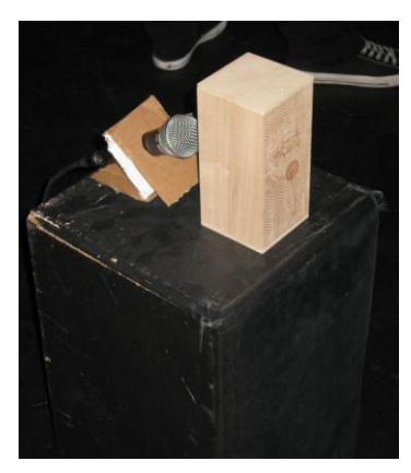
Music box, Complex Movements, Emergence Media

The show interrogates and translates these dense ideas into digestible context through a succession of head-nodding songs written by