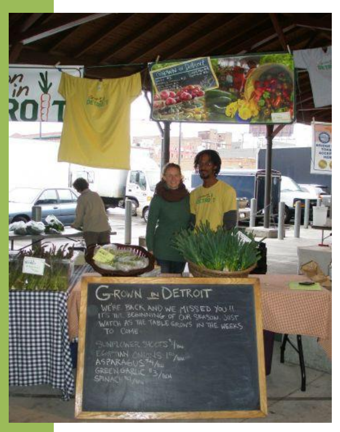
Detroit Eastern Market

to showcase the city's emerging visual artists and offer event rental space to the creative community.