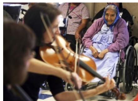
Tucson Symphony Orchestra String Quartet performs at nursing facility on the Tohono O'odham reservation, 2010.

Experimentation can encompass everything from annual Fourth of July concerts in the park, to Martin Luther King and Memorial Day concerts for the community, to residencies co-curated by culturally specific partners. Here are a few examples: