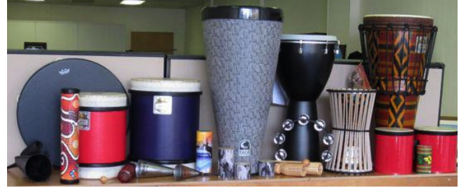
Central Ohio Symphony's drumming circle for juvenile offenders.