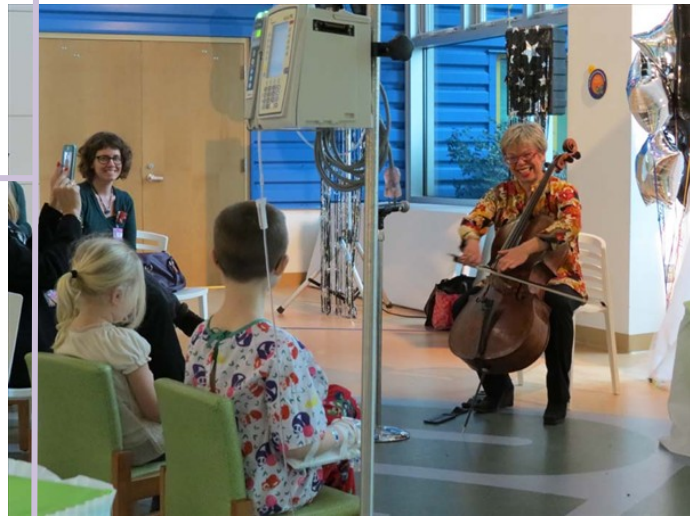
Pittsburgh Symphony Orchestra Music & Wellness program. Marvin Makes Music Book Reading, January 2013, Children's Hospital of Pittsburgh of UPMC.

A collection of writings depicting the wide range of ways the arts make community, civic, and social change.