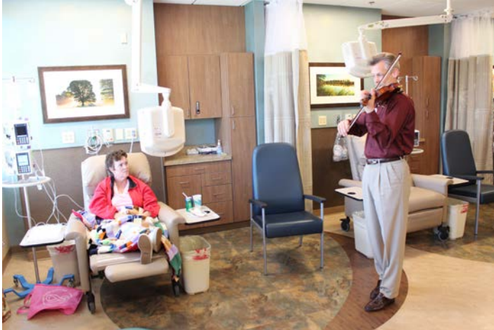
Knoxville Symphony Orchestra Music & Wellness program.

With the baseline created by the PSO, orchestras from Knoxville to Madison, Wisconsin have adapted and created similar programs. In Knoxville, musicians play solo or in small ensembles in hospital wards, lobbies, and, at times, for the medical practitioners themselves. At the Madison Symphony, a quartet of musicians from the orchestra performs dozens of times per year in health care settings including nursing homes and long-term medical care facilities. One rehabilitation patient participating in the program said the experience “helped me forget where I was, and gave me hope.”