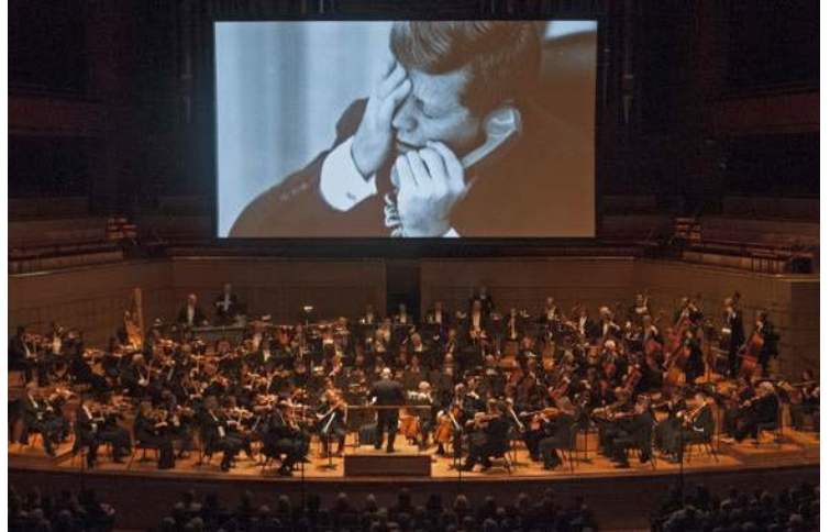
Dallas Symphony Orchestra performing Conrad Tao's "The world is very different now," 2013.

Just as Picasso's Guernica stands as a metaphor for the atrocity of war, so do these contemporary works reflect the moral conscience of our time. The local partnerships that often accompany these premieres, and the interest and dialogue that they trigger, are powerful contributors to raising awareness and understanding of issues—local, national, and global—in society.