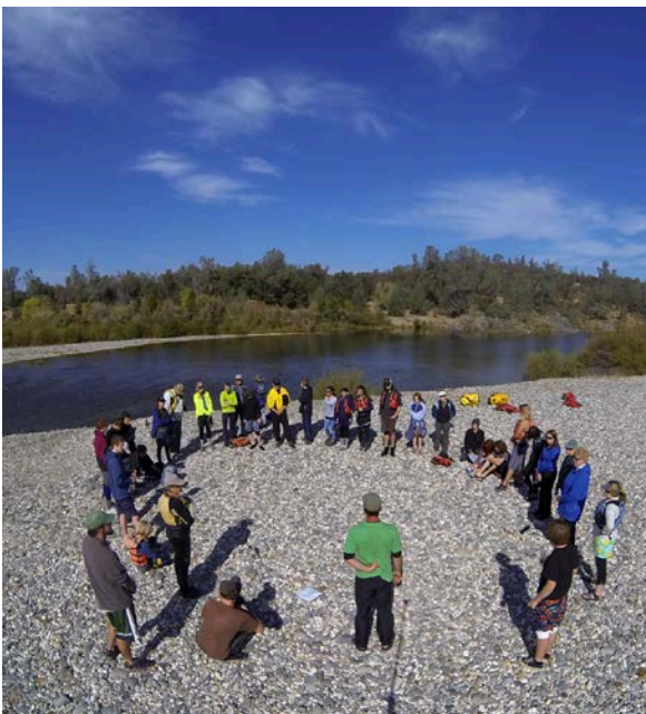
Music in the Mountains.

Symposium with environmentalists and engineers, and the culminating event, "Shall We Gather at the River," which took place at PingTom Memorial Park with the dedication of a new boat house by Mayor Rahm Emanuel.